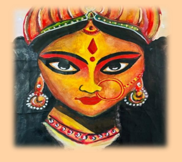
Deeptanshu Sarkar IX-C