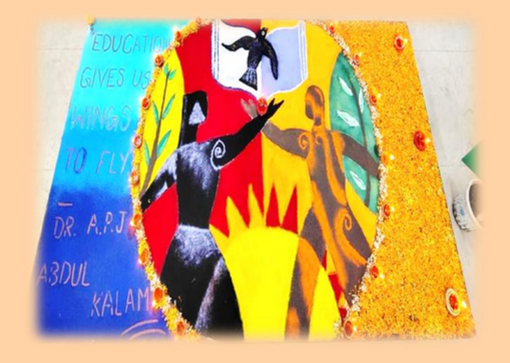
RANGOLI BY TAGORE HOUSE