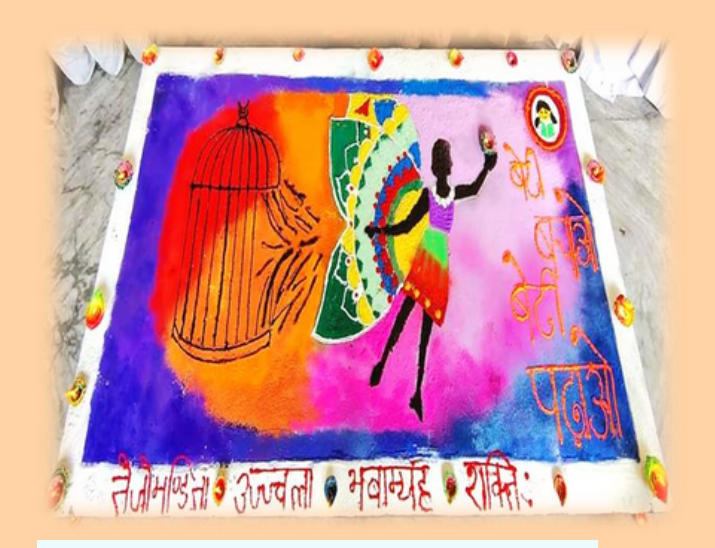
RANGOLI BY VIVEKANANDA HOUSE