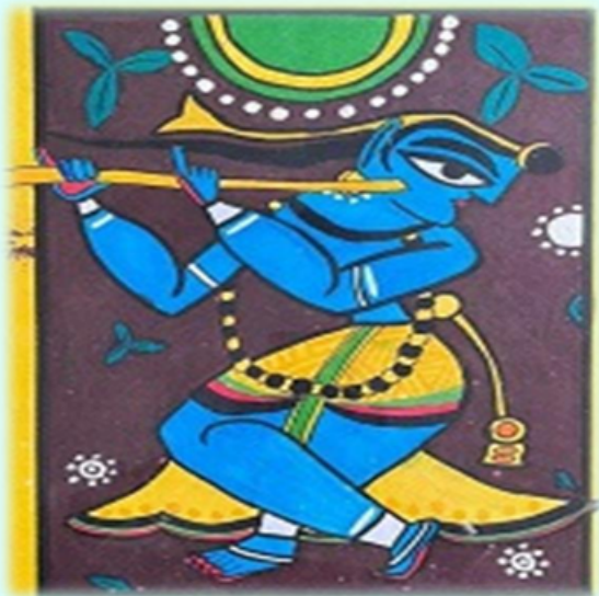
Aarush Das, Class 8